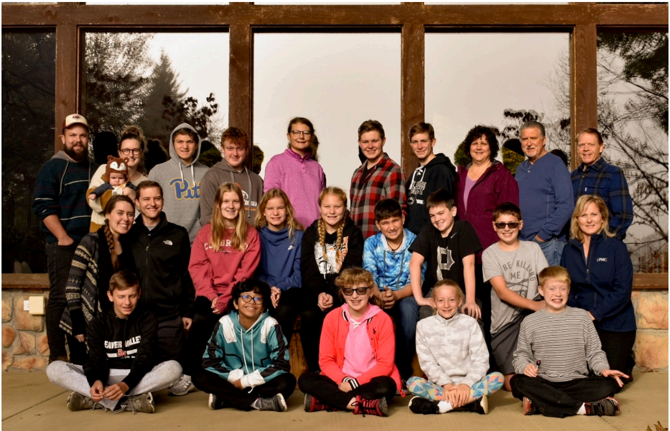
SWAP Retreat 2019 at Seneca Hills Bible Camp